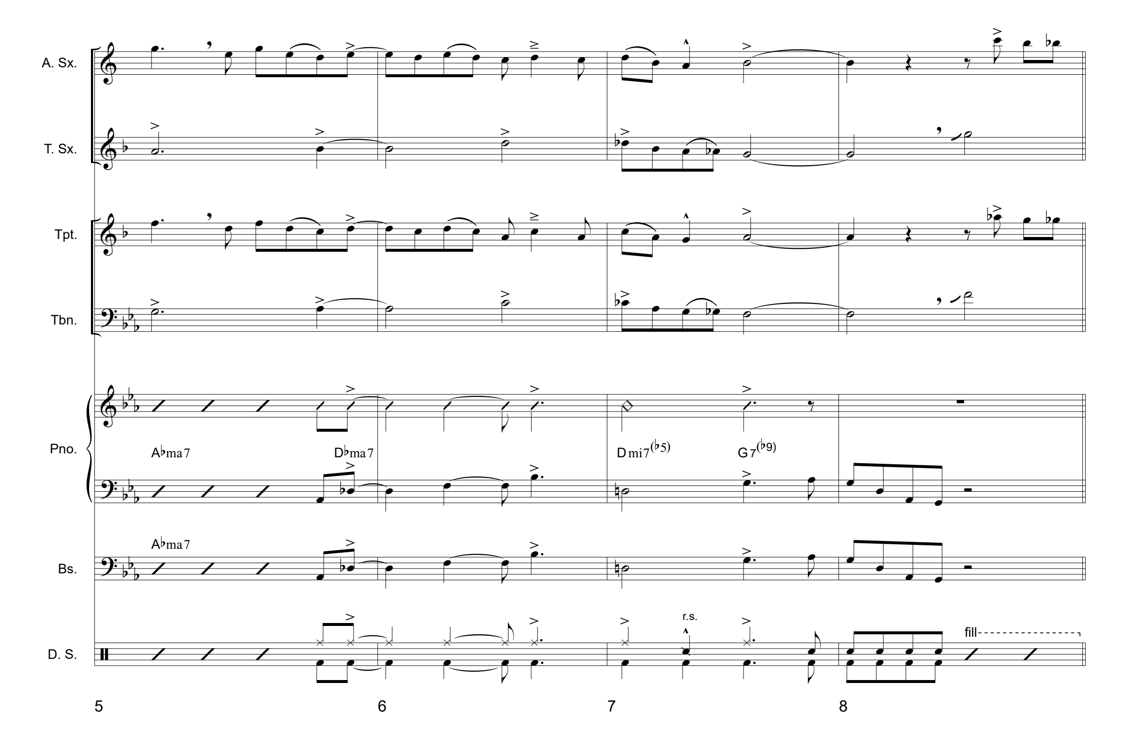
BE PRESENT from THE DEMOCRACY! SUITE Score - Page 2