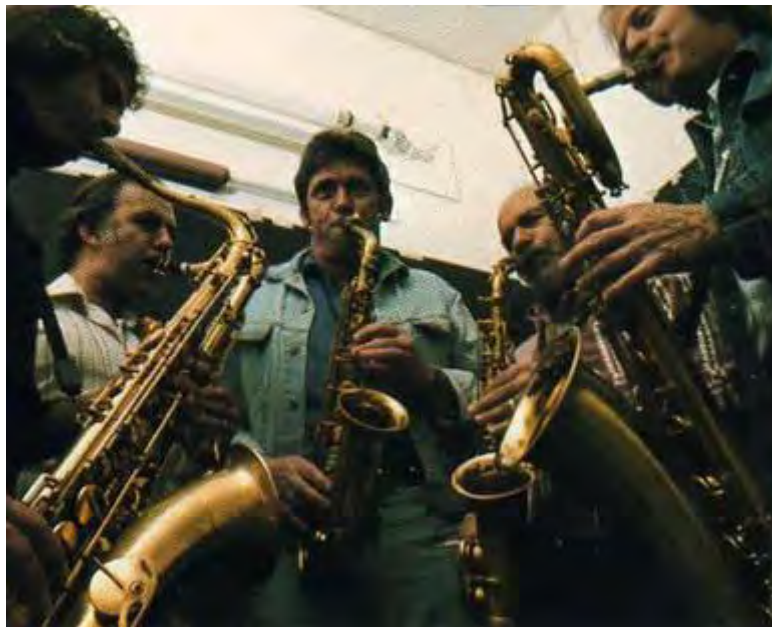
Cover photo from the 'Joy of Sax' album.