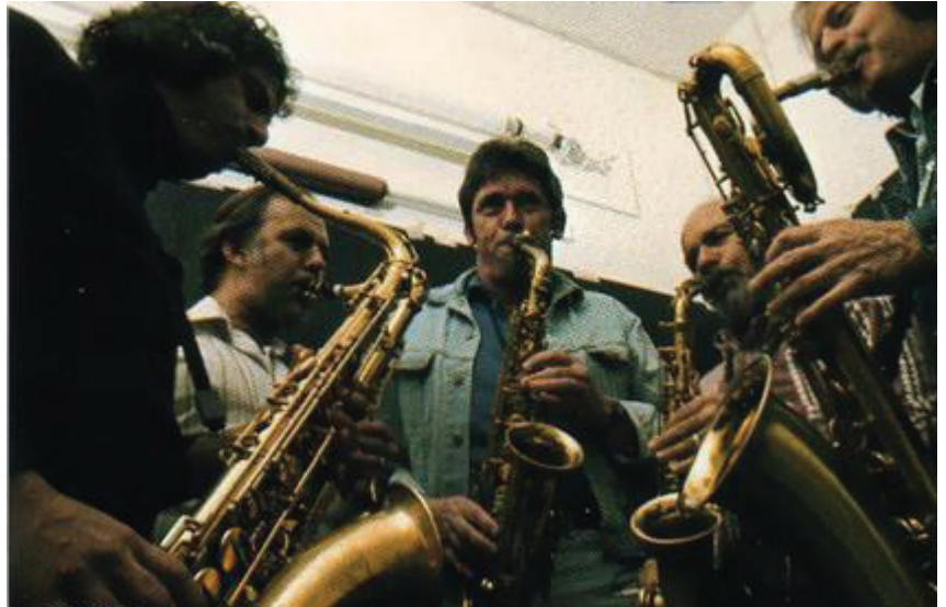
Cover photo from the 'Joy of Sax' album.